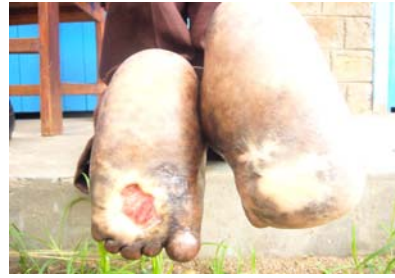
Left foot ulcer after dressing in Yei TB/Leprosy Program