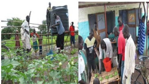
Vegetable farm for PALS supported by AAA