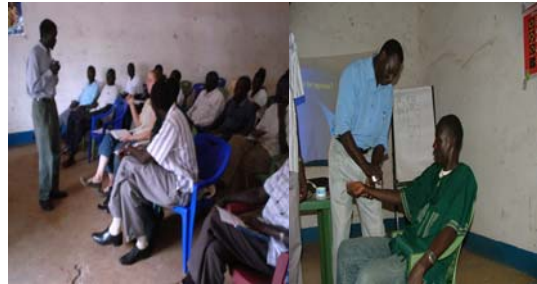
Leprosy training in Eastern Equatoria State