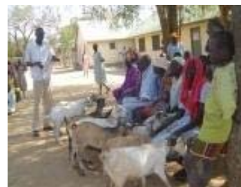
Goat project for PALS in Marial Lou, Warap State Supported by AAA