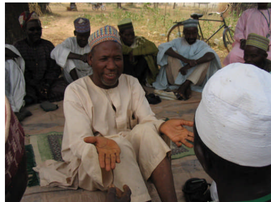
GOOD: The group leader is the first to be inspected