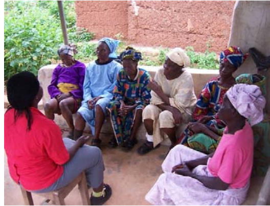
A good venue for a small group