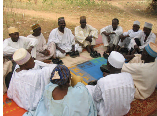
In a circle, shoes in front, a perfect setting.