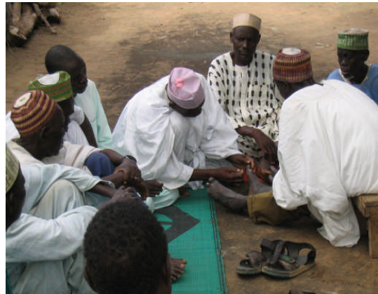
Inspection of feet