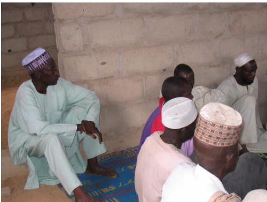
GOOD: The facilitator is present, but not in the circle.