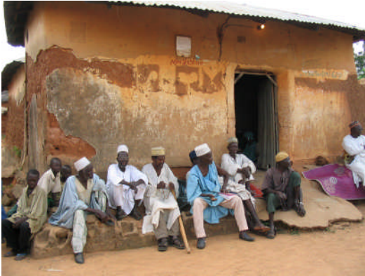
Meeting venue on the road, not sitting in a circle. NOT GOOD.