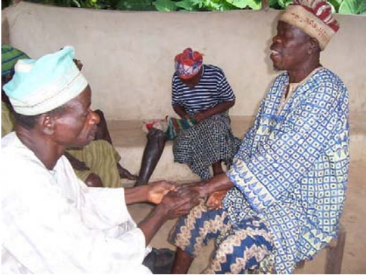
Inspection of hands