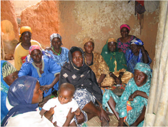
Meeting venue too small, no space for inspection of eyes, hands and feet