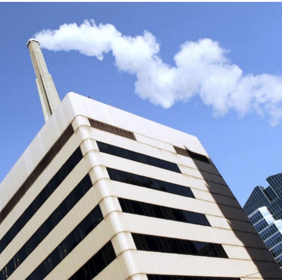
Health care organisations must take urgent action to reduce their carbon footprint

The report sets out what is being done globally, by the European Union and by the UK government to tackle climate change. It provides recommendations for health professionals. Measure your own carbon footprint; turn appliances off; improve ventilation and insulation; save water; reduce waste; buy fresh local produce; and cut down on meat, dairy products, and saturated fats. Avoid overly processed or packaged foods and bottled water. Use public transport, walk and cycle more, cut unnecessary flying and driving.